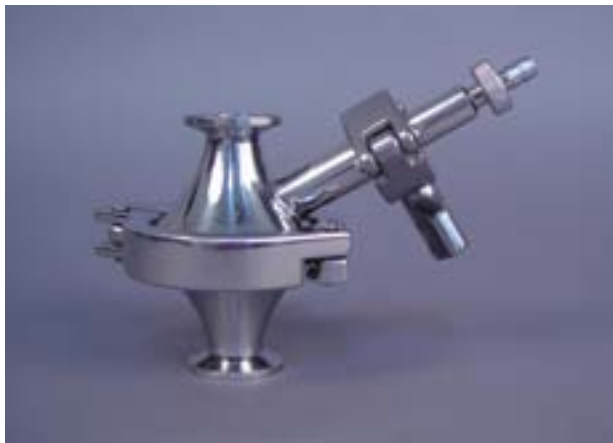
Part Number: CSH-47

CHP 47 mm Polypropylene Disc Holders are designed to give you an economical alternative when sampling and evaluating media. It comes standard with EP O-ring and 1/4-inch MNPT inlet and outlet connections. Assembly is easy. Simply insert the 47 mm disc and thread the two body halves together.