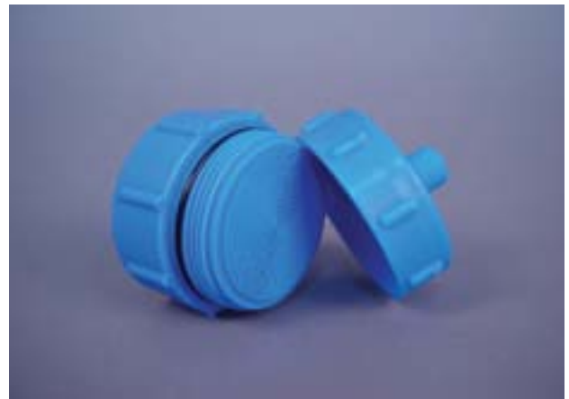
Part Number: CHP-47

Request a QUOTE from your area representative