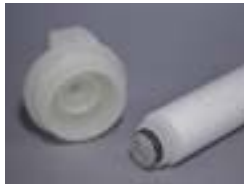
Optional 2-222 Style SOE