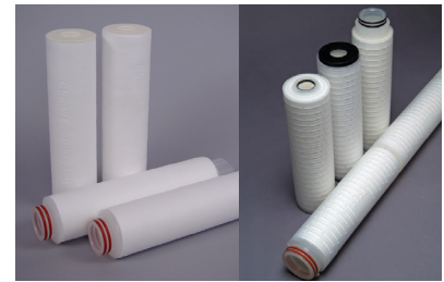
Figure 2 – Critical Process Filtration’s Melt-Blown and Nano-Spun Polypropylene filters and pleated depth media filters are available in a wide variety of configurations to fit existing housings