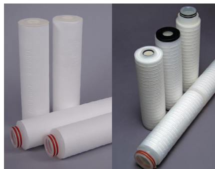
Figure 2 – Critical Process Filtration’s Melt-Blown and Nano-Spun Polypropylene filters and pleated depth media filters are available in a wide variety of configurations to fit existing housings.

Contact Critical Process Filtration for help determining the best filter options for you, or visit us at www.criticalprocess.com for more information and to access data sheets with more detailed information on all of our products.