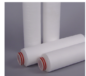
Figure 2 – Critical Process Filtration standard depth filters

Standard depth filters are made by forming the fibers into tubes with thick walls using the melt-blown process. These types of filters capture particles through the depth of the media. Examples of standard depth filters are shown in Figure 2. The trap filter (housing 1 in Figure 1) may hold a standard depth filter. Polypropylene is the most common material for standard depth filters, though other more materials may be used for specialty applications.