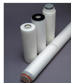
Figure 3 – Critical Process Filtration's pleated depth filters are available in configurations to fit existing housings.

Figure 3 shows filters made using flat sheet media made using polypropylene or fiberglass. The flat sheet media is pleated to create more surface area. With the increased surface area, the filters are capable of capturing and holding a larger quantity of particles. This increased capacity makes using pleated flat sheet depth filters for clarifying filtration (housing 3 in Figure 1) a preference for many facilities. Facilities also use the pleated media filters for trap filtration because they can hold more particles and will last longer in production.