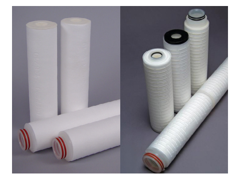
Figure 2 – Critical Process Filtration's Melt-Blown and Nano-Spun Polypropylene filters and pleated depth media filters are available in a wide variety of configurations to fit existing housings.