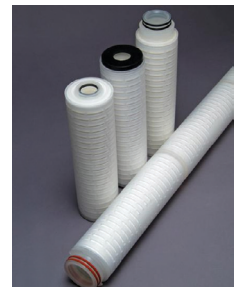
Figure 2 – Critical Process Filtration’s pleated filters with multiple membrane options are used for bacteria removal.

Contact Critical Process Filtration for help determining the best filter options for you.