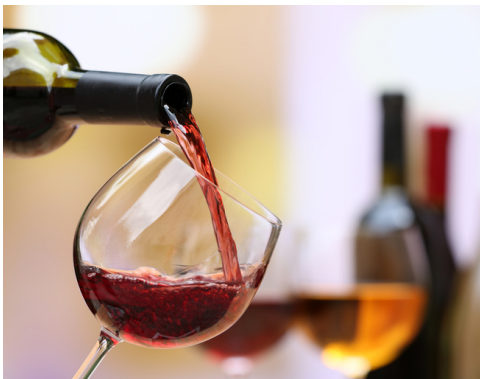
Figure 1 - Filtration in Wine Clarification/Stabilization

Figure 1 shows a simplified wine clarification, stabilization and packaging process. The fermentation and aging processes have been completed in this example, and the wine has been bulk filtered before being moved to a holding tank.