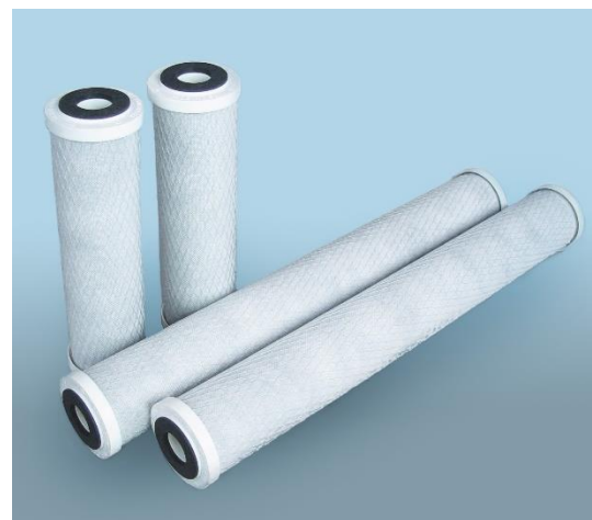
CARTRIDGES – Nominal Dimensions Length: 9.75 to 40 in. (24.8 to 101.6 cm) Outside Diameter: 2.70 in. (6.86 cm)