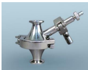
CSH DISC HOLDERS – 47 mm

The CSH is electropolished for maximum corrosion resistance and cleanability. The inlet and outlet are 3/4" sanitary flanges and the vent fitting is a 1/2" sanitary flange. O-rings and gaskets are silicone.