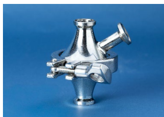
CSH DISC HOLDERS – 47 mm

The CSH is electropolished for maximum corrosion resistance and cleanability. The inlet and outlet are 3/4" sanitary flanges and the vent fitting is a 1/2" sanitary flange. O-rings and gaskets are silicone.