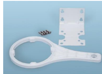
CHPN Sump Wrench – DOE 10” only