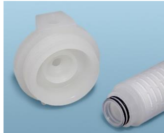
2-222 SOE Style, Optional