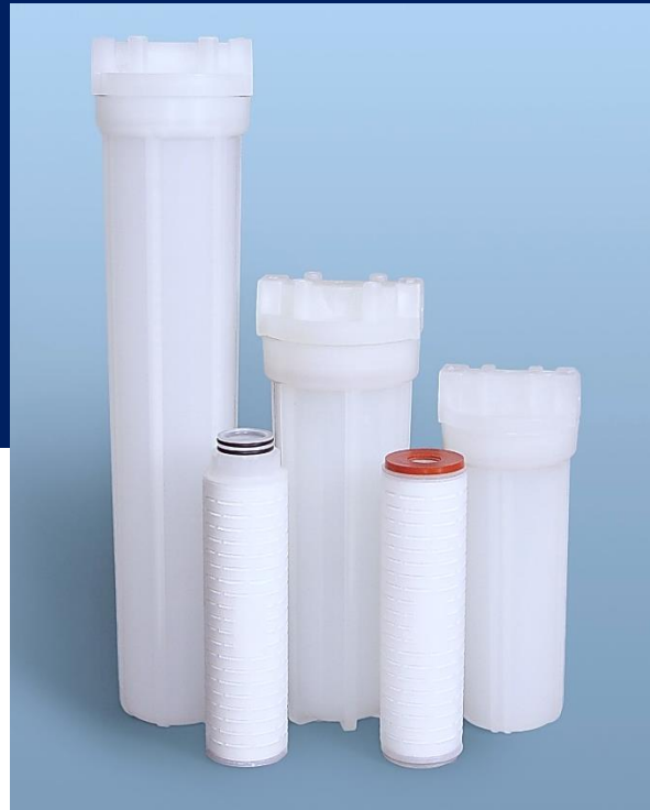
CHPN Polypropylene Housings Nominal Lengths – 10 in. and 20 in.

CHPN housings are made with 100% high purity polypropylene for wide chemical compatibility and low extractables. The rugged design has been tested up to 150,000 pressure cycles to 125 psi and passes a 500-psi burst test to ensure safe operation up to 100 psi. CHPN housings are available with connections to hold 10- or 20-inch filter cartridges with 2-222 SOE or DOE configurations.