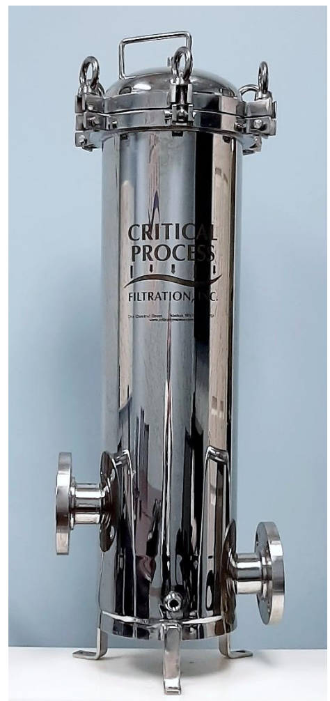
4- to 80-Round Industrial Housings Nominal Lengths – 10 in. to 40 in.