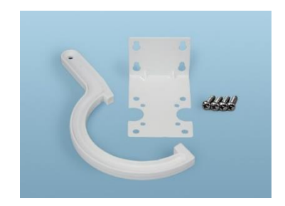
CHPN Half Sump Wrench