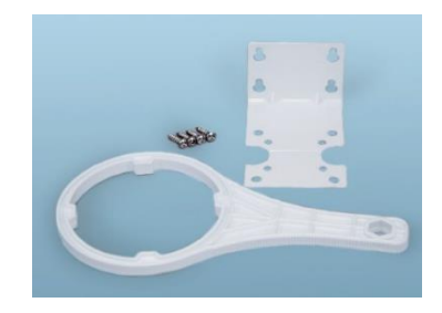
CHPN Sump Wrench - DOE 10" only