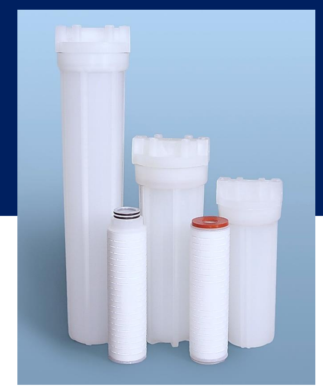
CHPN Polypropylene Housings Nominal Lengths – 10 in. and 20 in.

CHPN housings are made with 100% high purity polypropylene for wide chemical compatibility and low extractables. The rugged design has been tested up to 150,000 pressure cycles to 125 psi and passes a 500-psi burst test to ensure safe operation up to 100 psi. CHPN housings are available with connections to hold 10- or 20-inch filter cartridges with 2-222 SOE or DOE configurations.