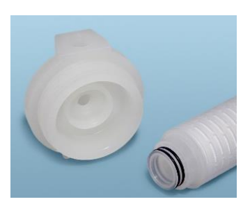
2-222 SOE Style, Optional