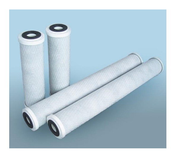
CARTRIDGES – Nominal Dimensions Length: 9.75 to 40 in. (24.8 to 101.6 cm) Outside Diameter: 2.70 in. (6.86 cm)