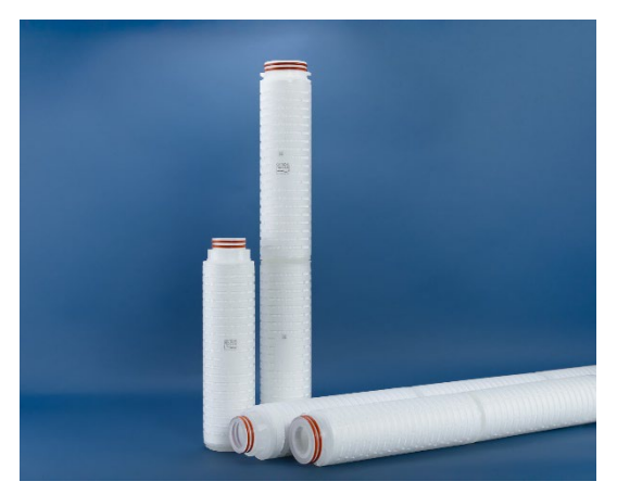
CARTRIDGES – Nominal Dimensions Length: 5 to 40 in. (12.7 to 101.6 cm) Outside Diameter: 2.75 in. (7.0 cm)