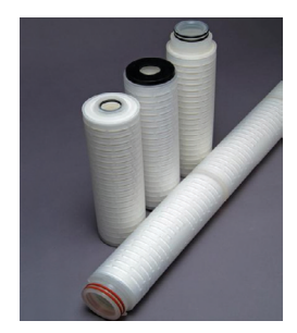
Figure 3 – Critical Process Filtration's pleated depth filters are available in configurations to fit existing housings.

Figure 3 shows filters made using flat sheet media made using polypropylene or fiberglass. The flat sheet media is pleated to create more surface area. With the increased surface area, the filters and are capable of capturing and holding a larger quantity of particles. This increased capacity makes using pleated flat sheet depth filters for clarifying filtration (housing 3 in Figure 1) a preference for many facilities. Facilities also use the pleated media filters for trap filtration because they can hold more particles and will last longer in production.