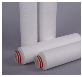
Figure 2 – Critical Process Filtration standard depth filters

Standard depth filters are made by forming the fibers into tubes with thick walls using the melt-blown process. These types of filters capture particles through the depth of the media. Examples of standard depth filters are shown in Figure 2. The trap filter (housing 1 in Figure 1) may hold a standard depth filter. Polypropylene is the most common material for standard depth filters, though other more materials may be used for specialty applications.