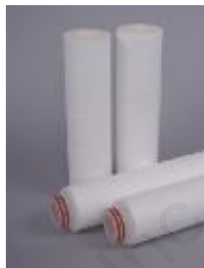
Figure 2: Critical Process Filtration Standard Depth Filters

The table below shows the filter media options for trap and clarifying filtration from Critical Process Filtration. All are also available in capsules for laboratory scale filtration and product research.