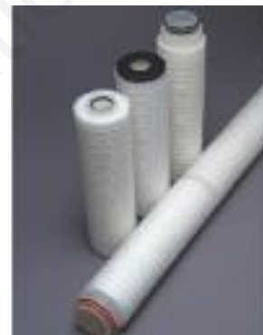
Figure 3: Critical Process Filtration's Pleated Depth Filters are Available in a Wide Variety of Configurations to Fit Existing Housings