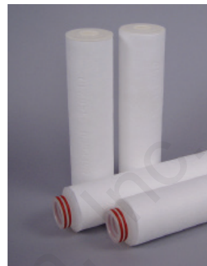
Figure 2: Critical Process Filtration Standard Depth Filters

Critical Process Filtration has several filter options, as shown in the table below. These filters are available as cartridge filters and disposable capsule filters as well as in flat disc form for laboratory scale testing.