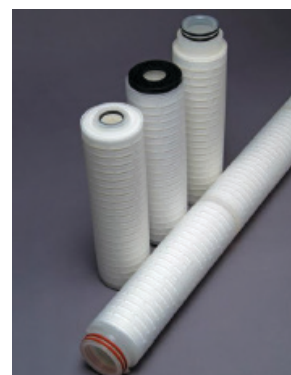
Figure 3: Critical Process Filtration's Pleated Depth Filters are Available in a Wide Variety of Configurations to Fit Existing Housings